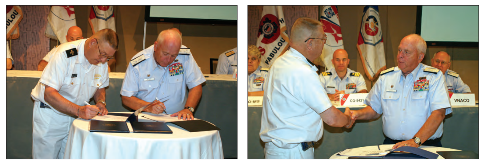
CHARLOTTE, N.C. – Frank Dvorak, USPS Chief Commander and Jim Vass, USCG Auxiliary National Commodore sign the Auxiliary-USPS Implementation Plan.

The United States Power Squadrons is the nation's largest nonprofit recreational boating organization with a presence in all 50 states plus the territories of Puerto Rico and the Virgin Islands as well as Japan. There are more than 40,000 members in 400 squadrons and 33 districts worldwide. For more information about the U.S. Power Squadrons visit http://www.usps.org.